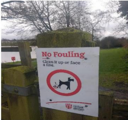
New Dog Control Signage