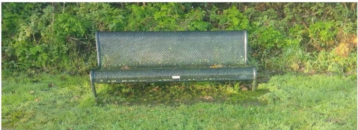
On-site seating, picnic tables and litter bin provision will continued to be monitored