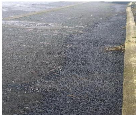
Carpark resurfacing and repairs