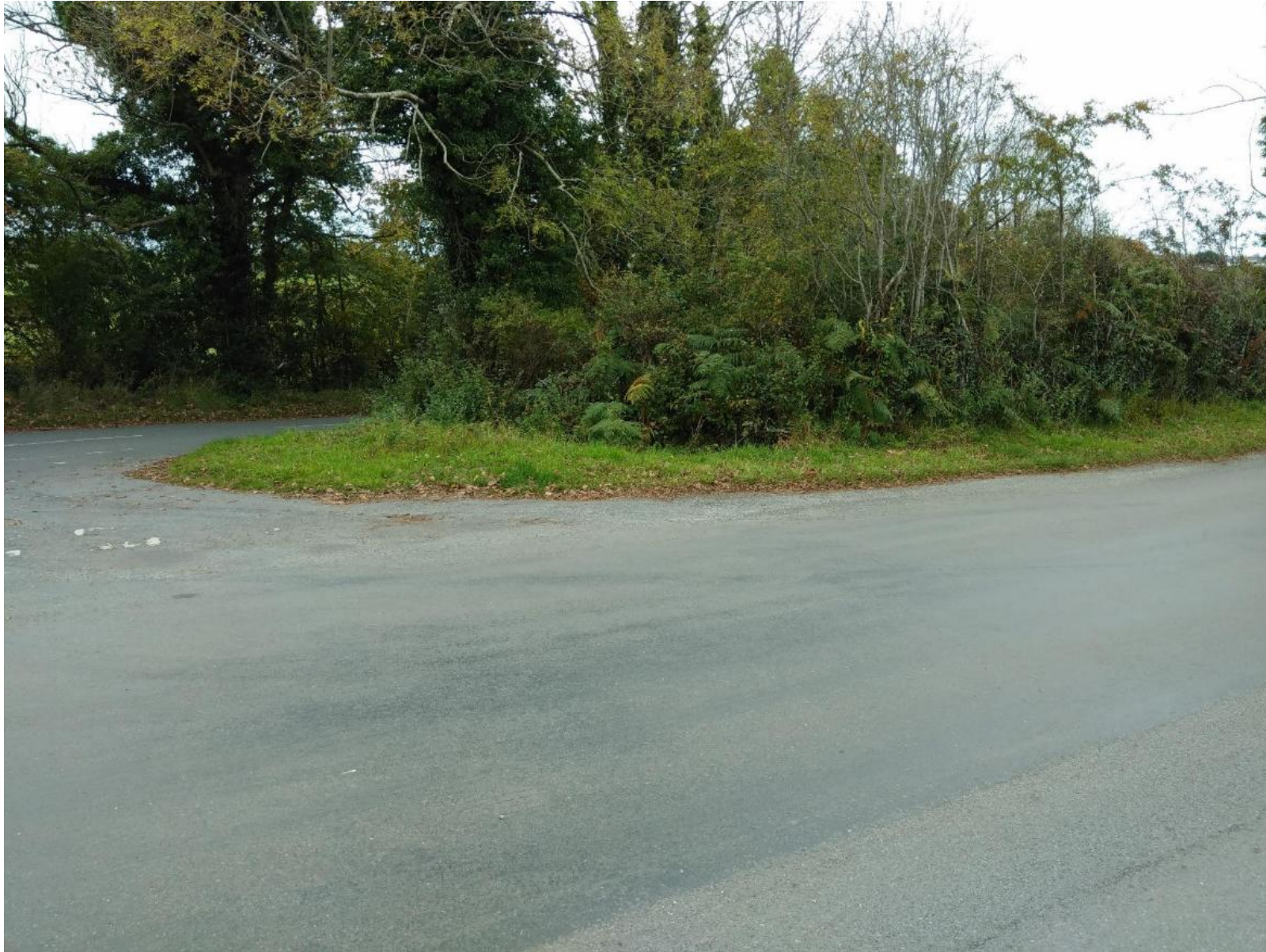
Fig 3 Derry Road Junction with Derryvale Road (No Signage Evident)