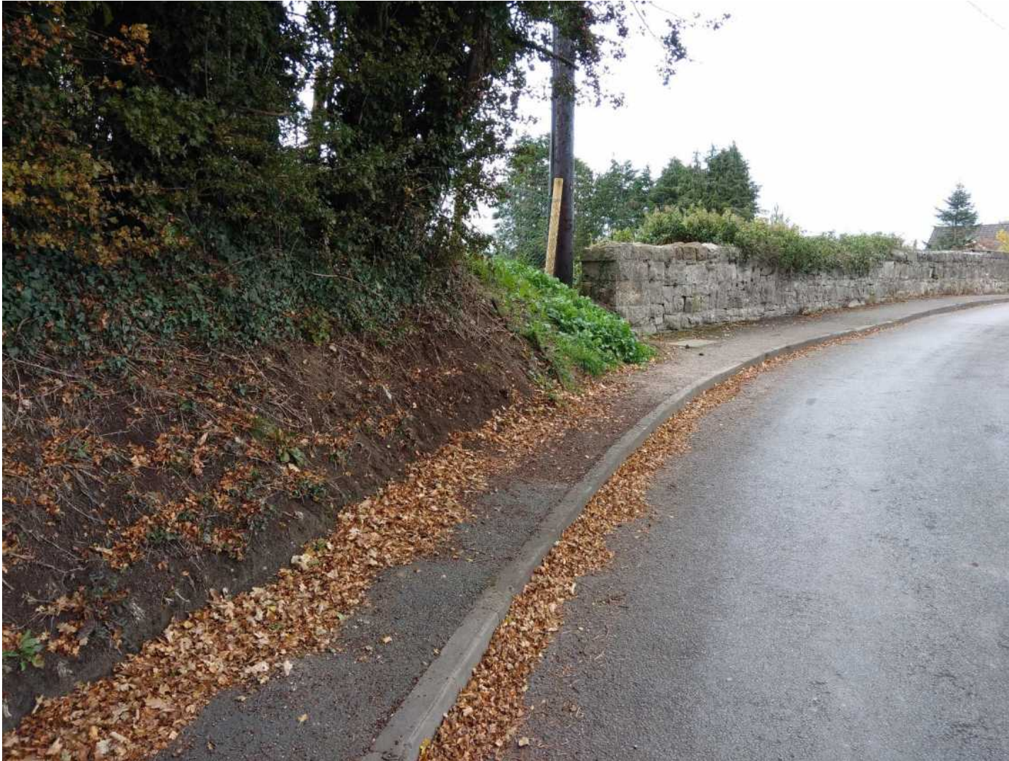
Fig 4 Derry Road Junction with Railway View (No Signage Evident)