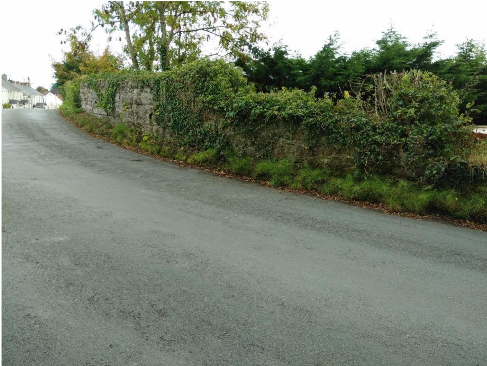
Fig 5 Derry Road Junction with Railway View (No Signage Evident)