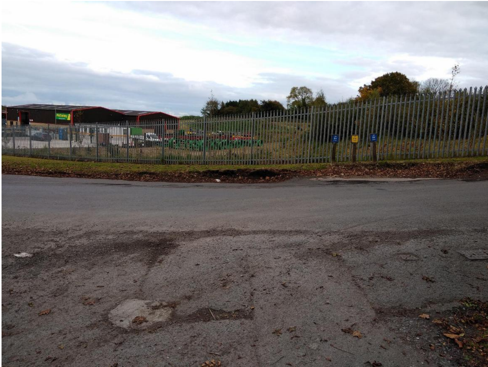
Fig 2: Derry Road Junction with Derryvale Road (No Signage Evident)