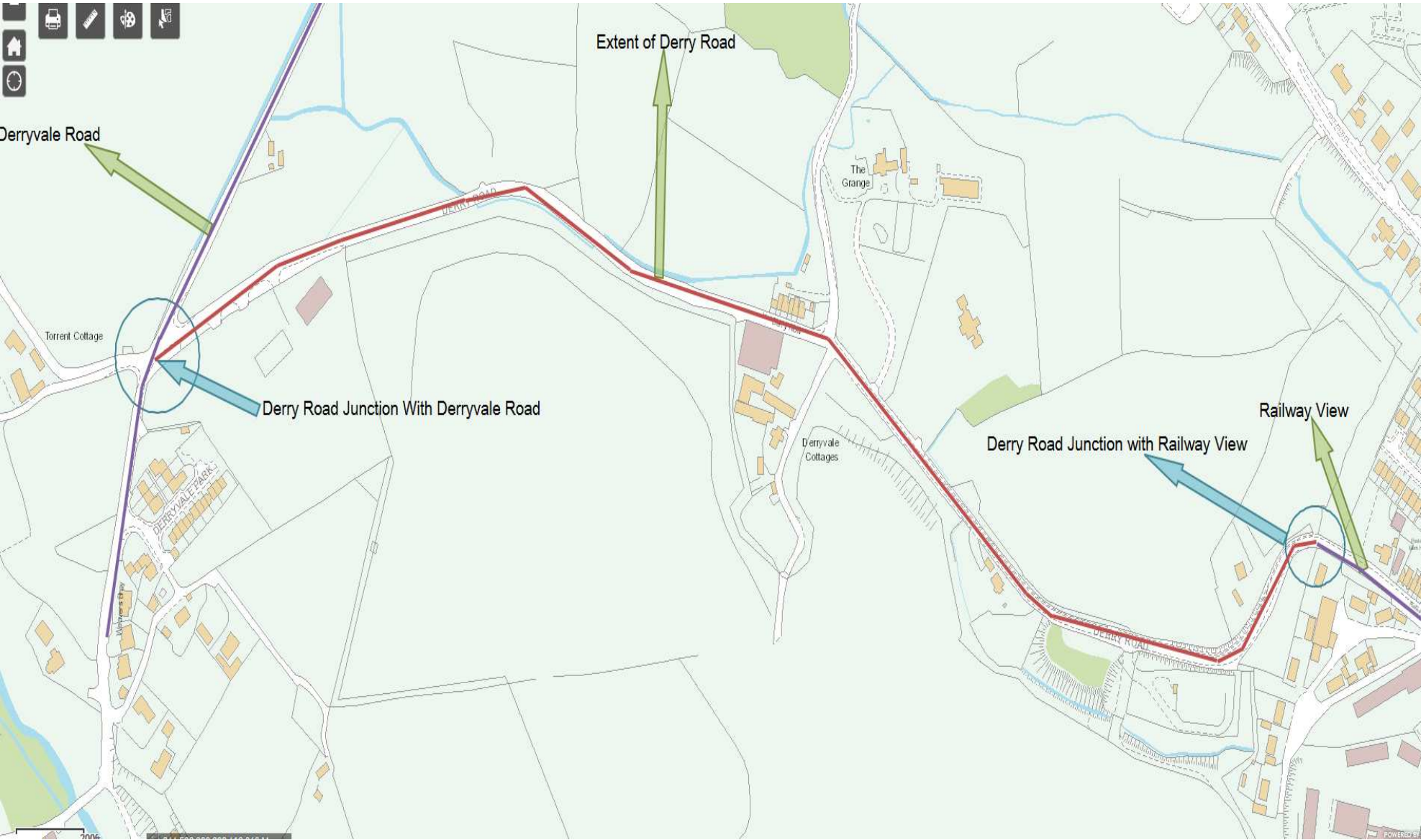
Fig 1 – Derry Road, Coalisland