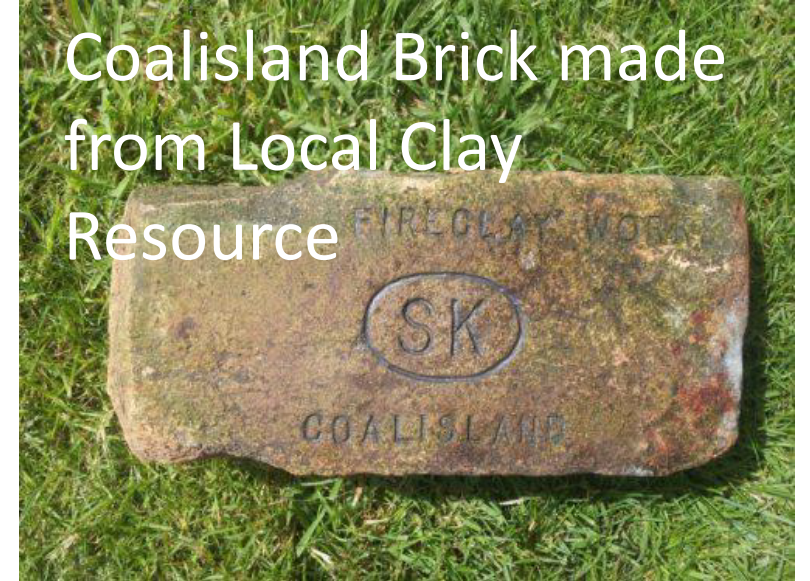
Coalisland Brick made from Local Clay Resource