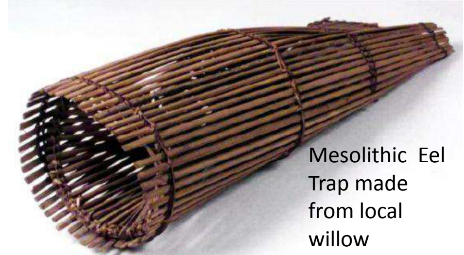
Mesolithic Eel Trap made from local willow