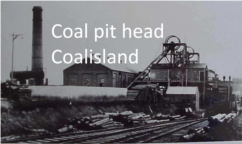
Coal pit head Coalisland