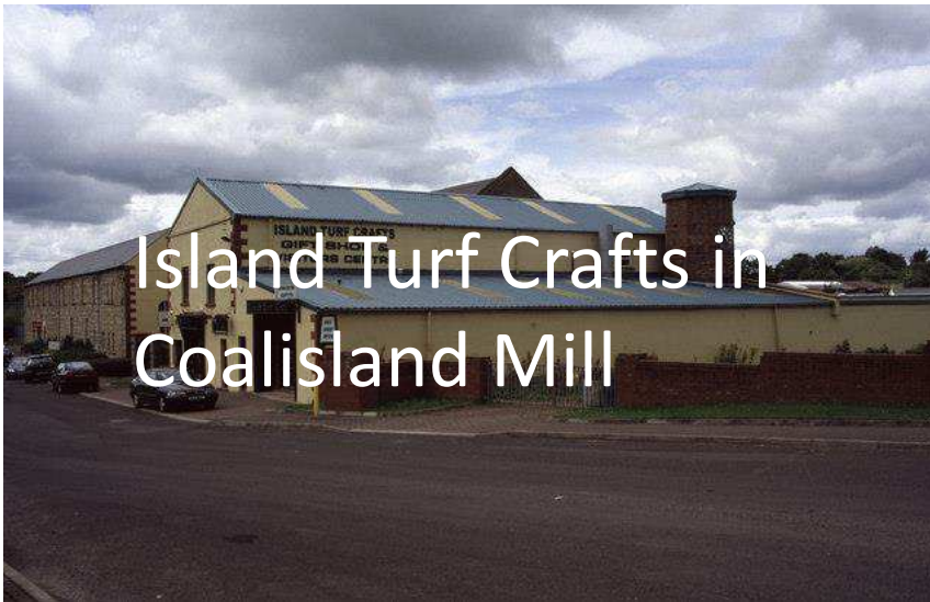
Island Turf Crafts in Coalisland Mill