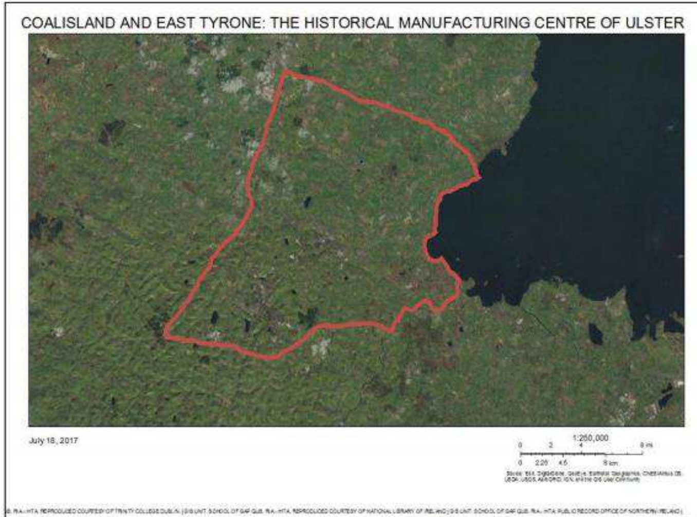
Proposed boundary for the Coalisland & East Tyrone Great Place Scheme based on the 1609 Bodley Map for the ancient districts of Munterevlin Owtra and Clonagherie