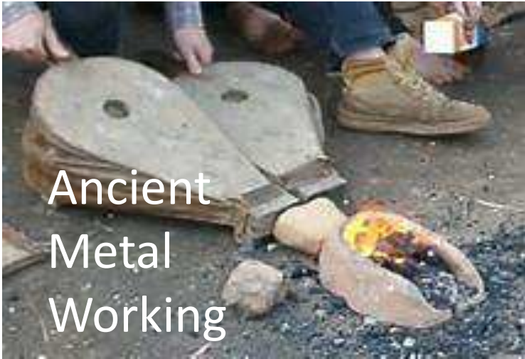
Ancient Metal Working