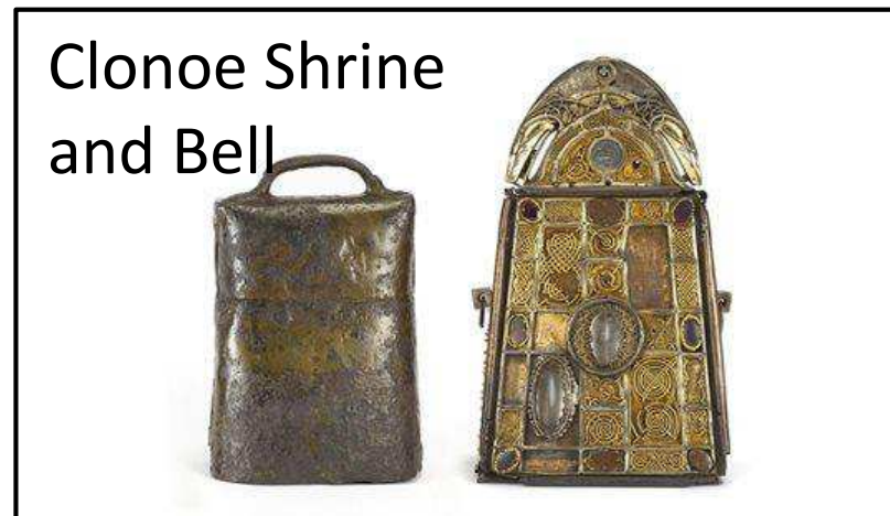
Clonoe Shrine and Bell