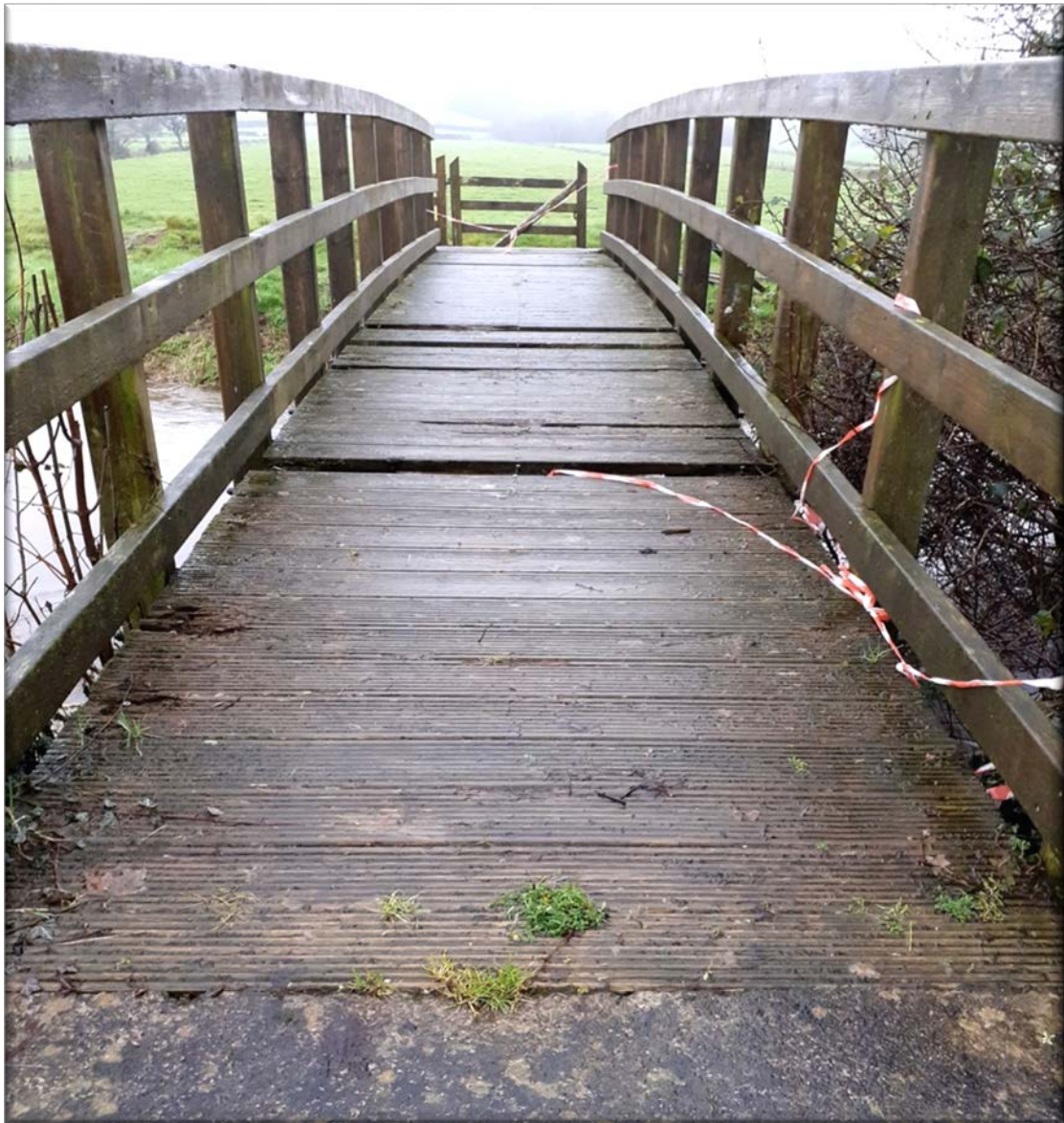
Fig 2 Bridge decking (timber) deterioration