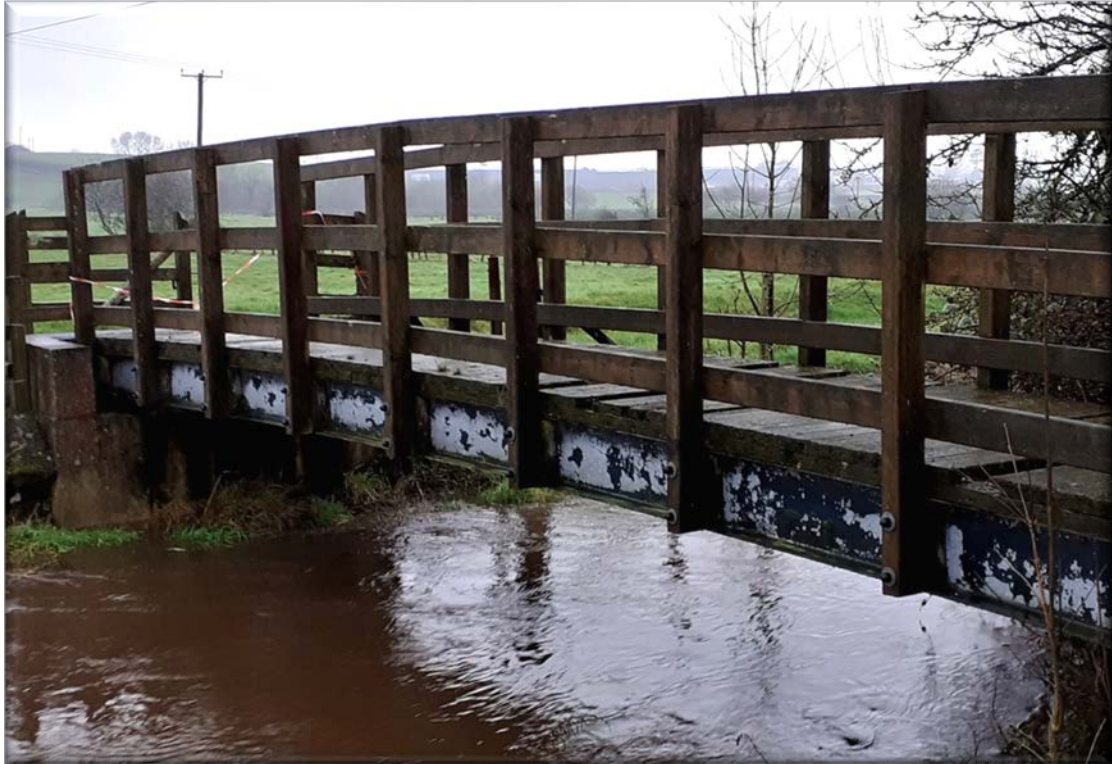
Fig 1 Side elevation of Bridge