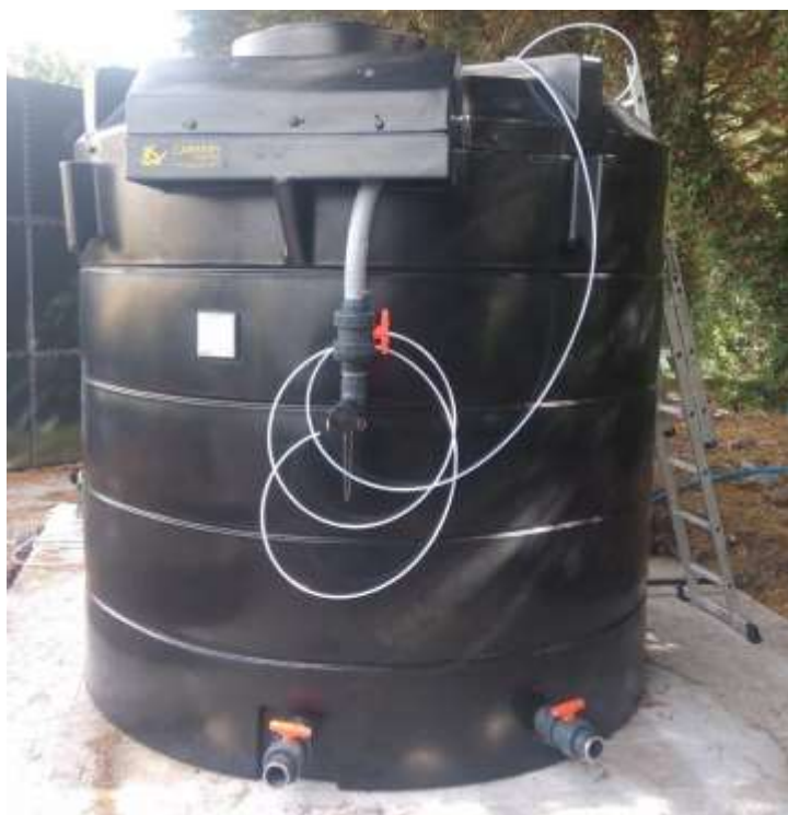
Picture 1: 5,000 litre bunded tank for storage of 30% Sodium Hydroxide Solution (Caustic Soda).

Some further minor site mothballing and landscaping works were carried out over the summer including maintenance of the new woodlands, and installation of a new pH dosing system. Indiwoods were on-site over the summer to carry out maintenance on the new woodlands which included hand weeding and the replacement of any dead trees. This work was grant aided from the Forest Expansion Scheme with a further £2,298 received for Year 2 maintenance. The pH dosing system, designed and installed by Drilling and Pumping Supplies at a cost of £12,500, automates operations and will improve the treatment efficiency of the leachate treatment plant. By ensuring optimum pH of the treatment plant at all times' Ammoniacal Nitrogen levels in the treated leachate will be lower' allowing for greater throughput of the Integrated Constructed Wetlands. Pictures showing the new pH Dosing system are shown below: