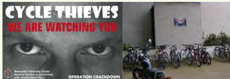
Left: The signage used in the experiment

location and one sign each at two locations). These displayed a 'watching eyes' image and were accompanied by the message 'Cycle Thieves, We Are Watching You' and the sub-messages 'Newcastle University Security Service in partnership with Northumbria Police' and 'Operation Crackdown'. The remaining 30 bicycle racks across the campus (ranging from 100m to 1000m from the intervention sites) acted as control locations in the experiment. Reported bicycle thefts were monitored at the intervention and control locations for 12 months prior to the intervention and 12 months during.