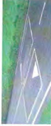
Traffic Calming Speed Cushions