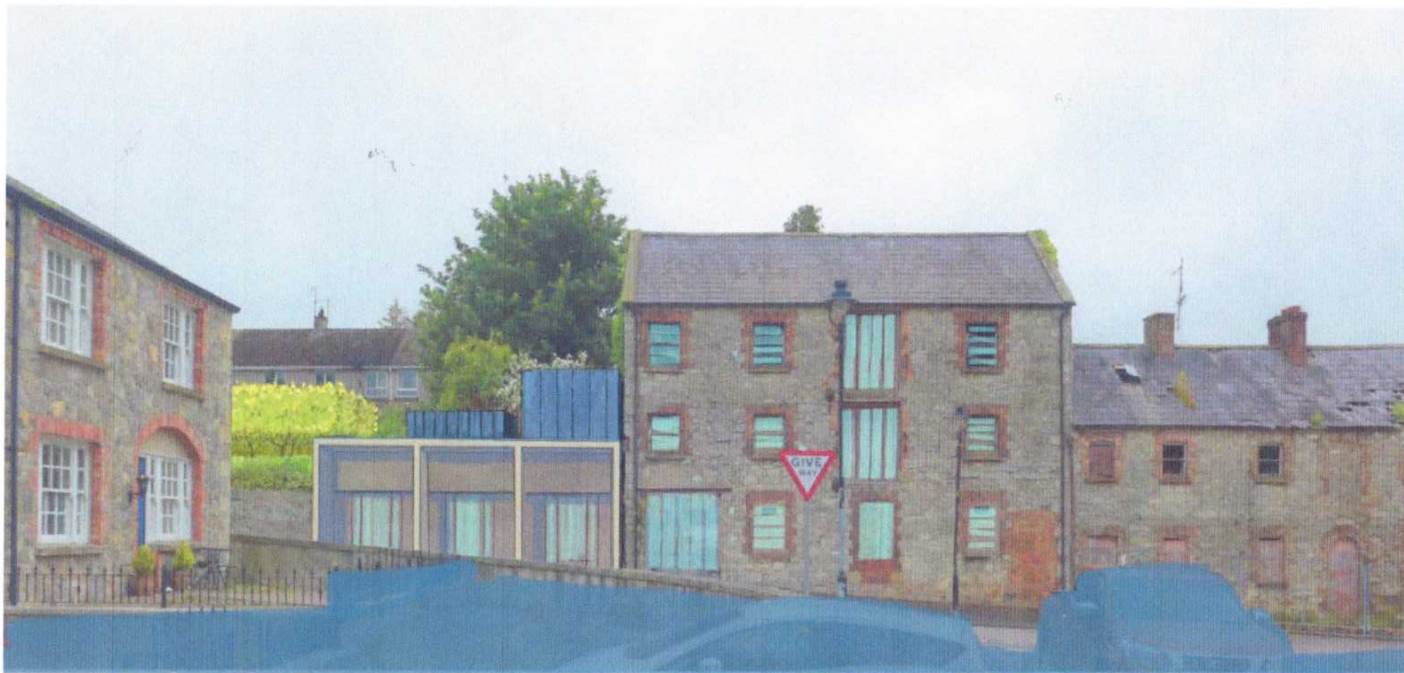
view from Mill Place