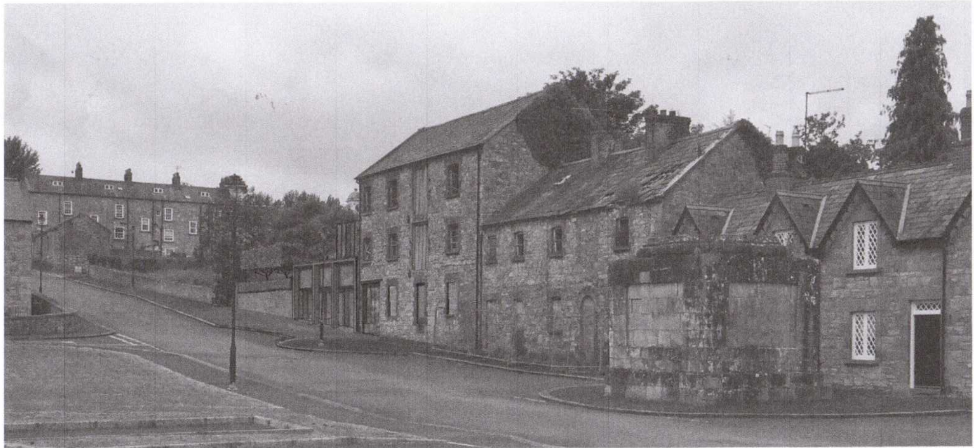
view from lower Mill Street looking up