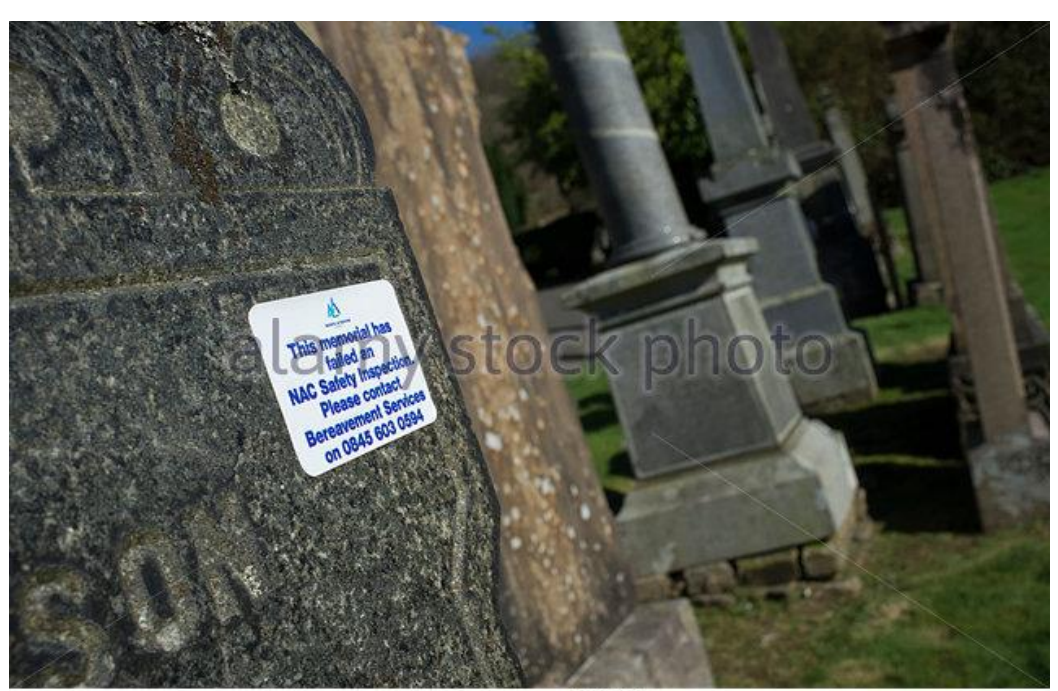
www.alamy.com - E52H12