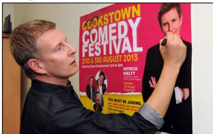
Entertainer Patrick Kielty was the first act in the Burnavon.

IT IS TO the credit of the Burnavon, its staff and its patrons that the venue, for 20 years now, has been punching above its weight in terms of the acts which are brought to the Mid-Ulster town.