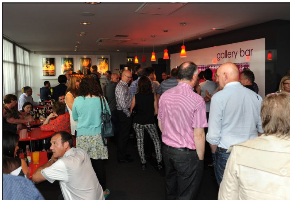
Capacity crowds are a regular feature in the Burnavon Arts Centre, Cookstown.

6. The Burnavon programme of events is posted to almost 10,000 households three times each year.