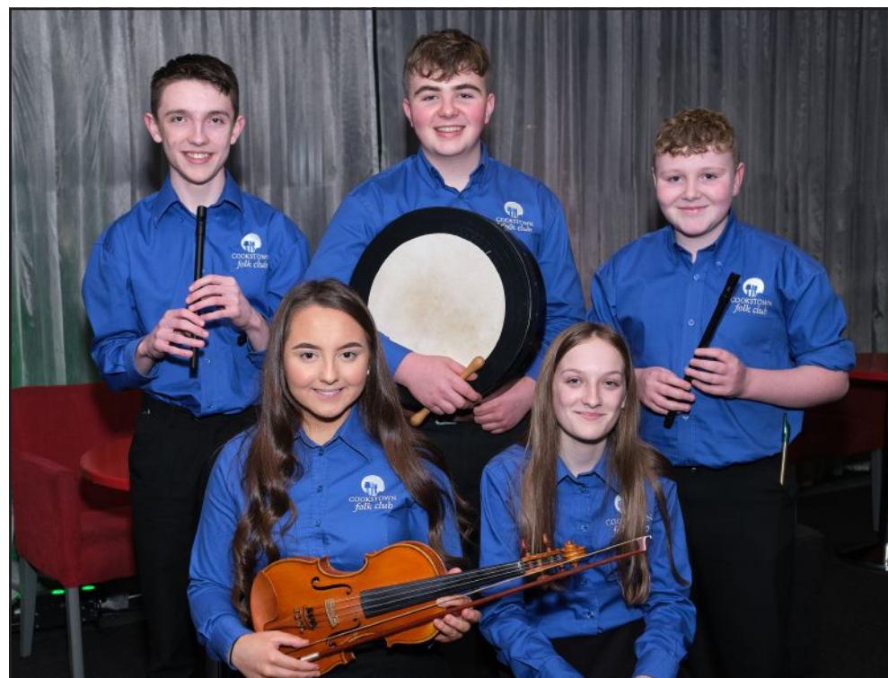
Cookstown Folk Club in The Burnavon.

50th anniversary of our Cookstown plant back in 2018, and we know that the Burnavon is now as synonymous with Cookstown as the cement plant is. Hopefully both will continue to serve this local area well for future generations, and that both continue to prosper and overcome any challenges they may face."