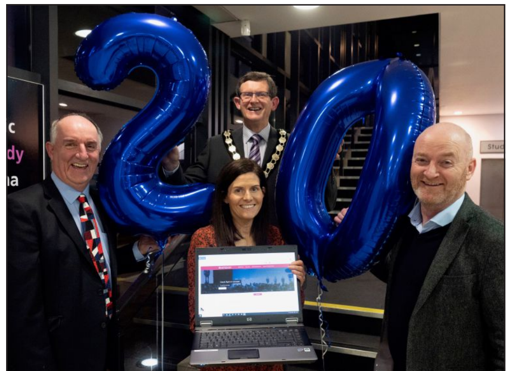
The Burnavon will celebrate entering its 21st year with a brand-new online look.

employees. Assessors examined five areas of operation of the arts centre, including the accessibility of all aspects of the centre to people with disabilities, participation by people with disabilities in the arts and in the audiences for events, as well as the development of policies and the employment of people with a disability.