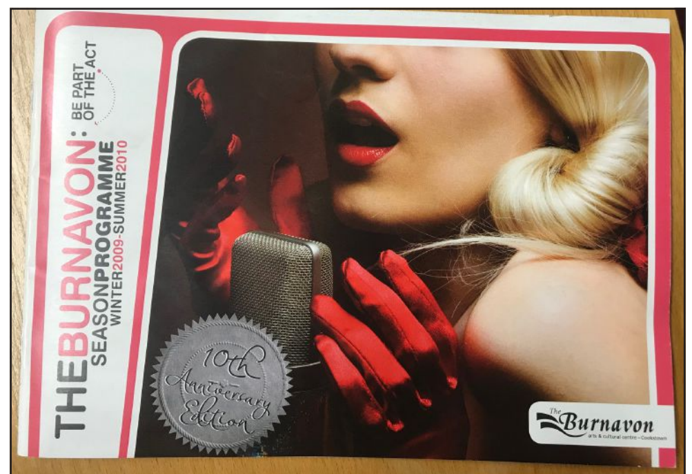
The Burnavon's season programme is a must for arts enthusiasts.

“The Burnavon is a credit to Cookstown and to its people, and something of which we can all feel rightly proud. And I firmly believe that the Burnavon will continue to serve us well for many, many years to come.”