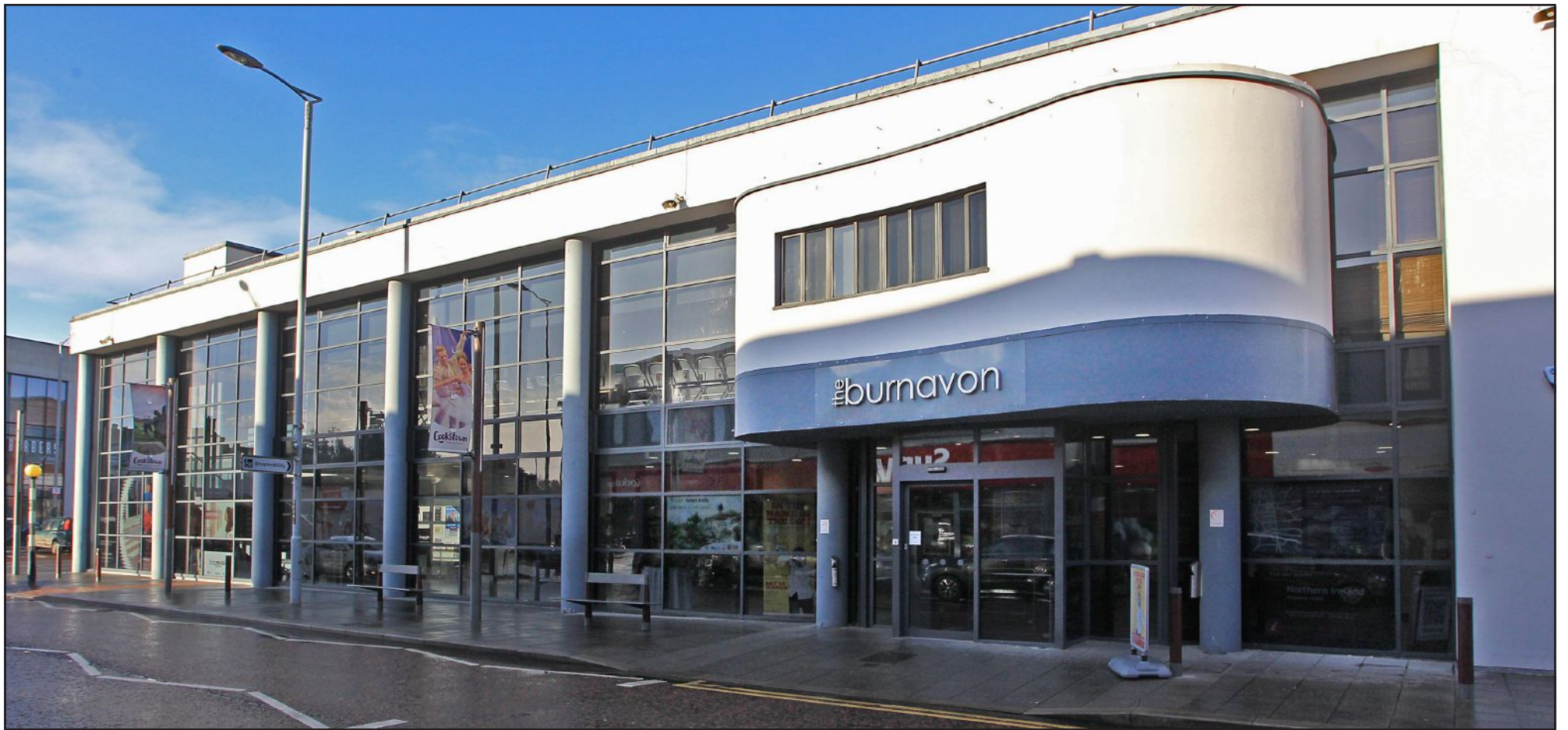
The Burnavon Arts Centre, Burn Road, Cookstown is marking its 20th Anniversary.

Comhairle Ceantair Lár Uladh Mid Ulster District Council