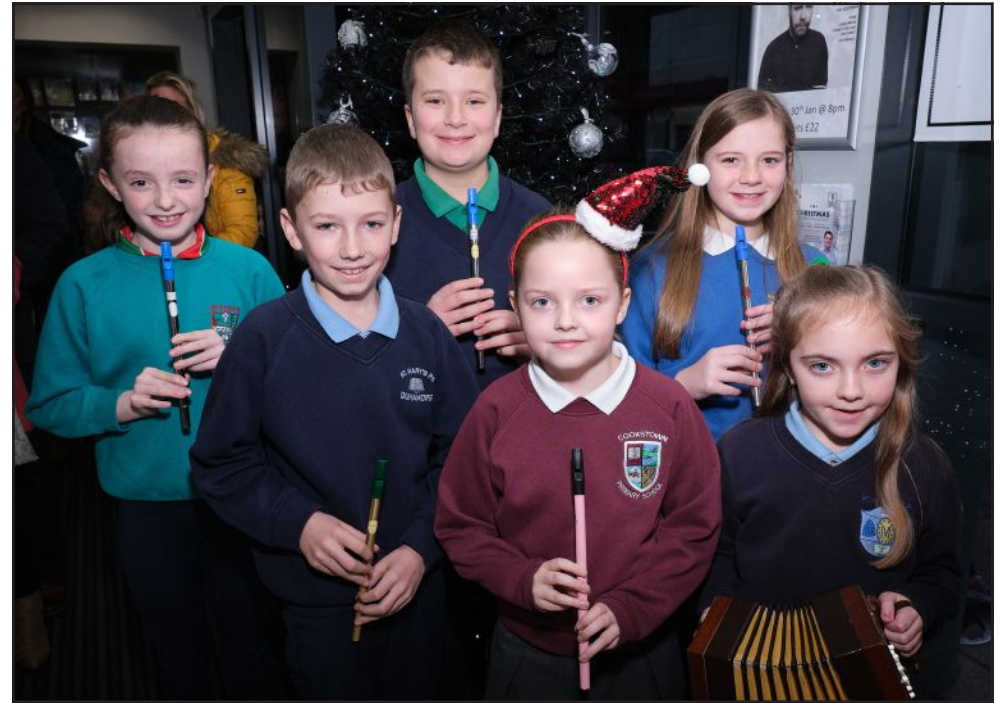
Music youth in The Burnavon.

The sense of pride felt by parents, grandparents, friends and families as their emerging stars strut their stuff on the Burnavon boards is truly immeasurable, and shows little sign of declining with the opportunities for those local talents continuing to come thick and fast.