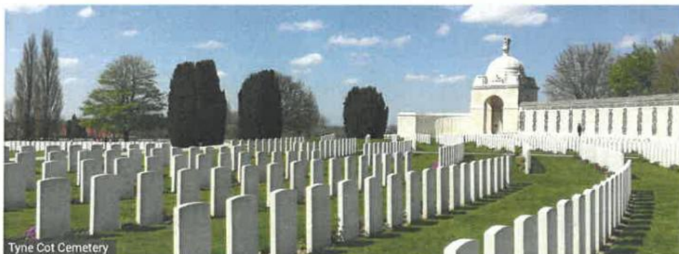
Tyne Cot Cemetery