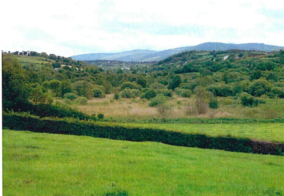
Figure 2.1 Photograph of Derryleckagh pRamsar

Derryleckagh is situated 1 km east of Newry. It is a long narrow valley mire and contains wetland and adjoining habitat which supports a wide range of plant communities and a number of scarce plant species (Figure 2.1). The variety of these habitats supports a wide diversity of invertebrates, including several notable species. The area of the site is 42.41 ha.