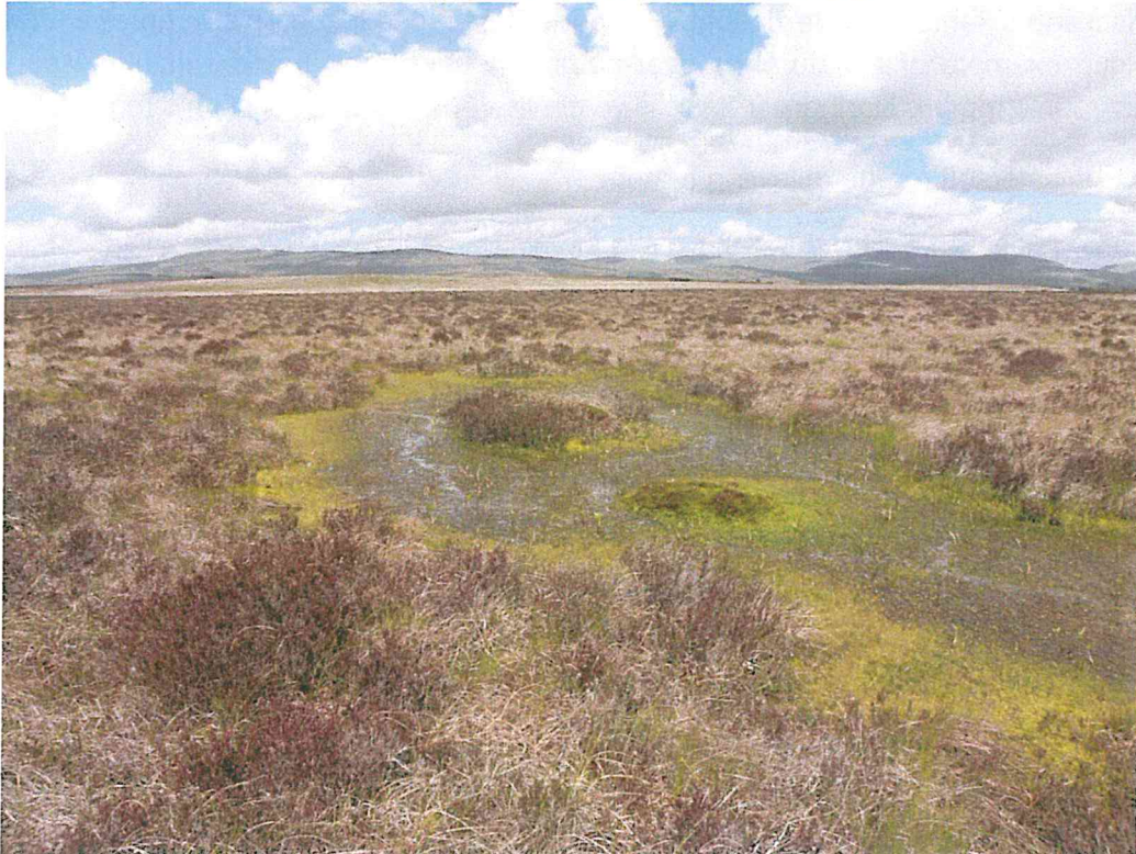
Figure 2.2 Photograph of Teal Lough pRamsar

Teal Lough Bog lies some 10 km north-west of Cookstown beyond Lough Fea at an elevation of 220 m. This is one of the largest and least disturbed upland blanket peat and raised bog habitats in Northern Ireland (Figure 2.2). The features of interest are all hydrologically linked, with actively developing upland raised bog surrounded by active blanket peat, and with an oligotrophic lake to the north. Teal Lough has one of the finest hummock and pool complexes of any peatland complex in Northern Ireland. The area of the site is 198.22 ha.