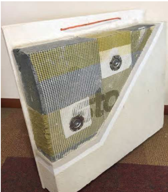
StoTherm Vario External Wall Insulation (EWI)