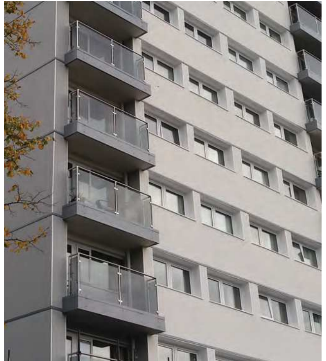
Vynylit Rainscreen at Whincroft House