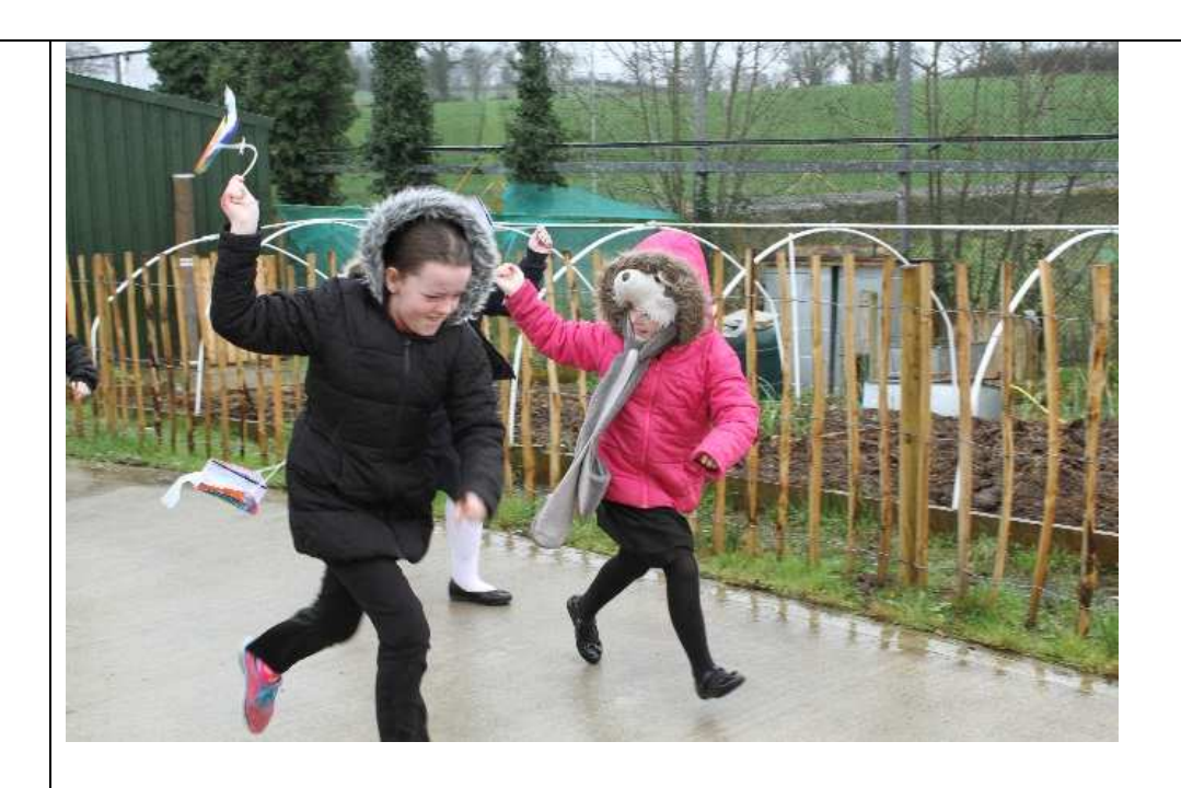
Key Stage 3