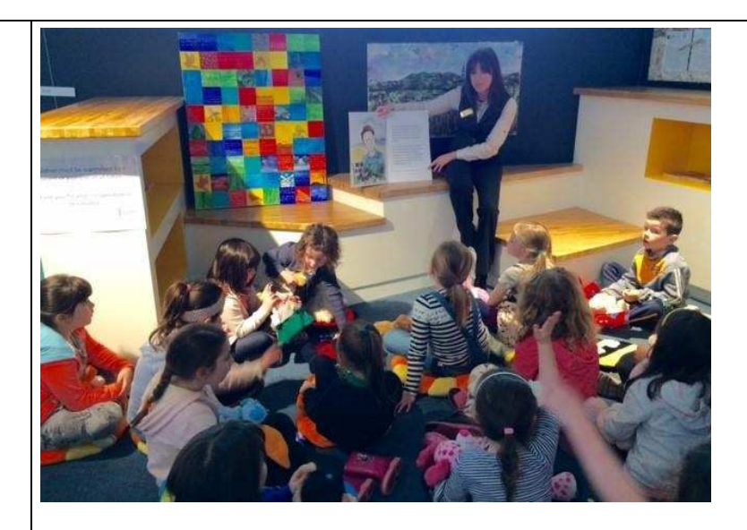
Key Stage 2

Seamus Heaney's grandchildren planted trees in the grounds of HomePlace on 26<sup>th</sup> January 2016 to mark the launch of this scheme, and this was supplemented by local children planting snowdrops and various other flowers to emphasise the importance of local children in the symbolic ceremony.