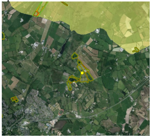
BWader x5, 50m, 503m, 580m, 580m, 989m from site