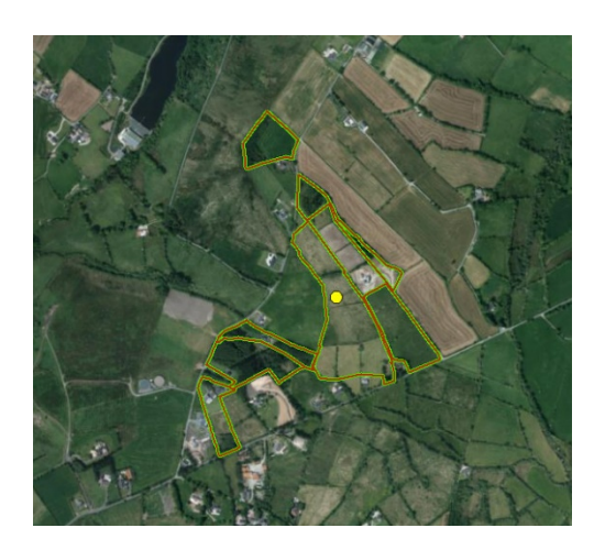
Sperrin AONB 830m from site boundary