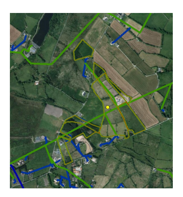
Medium Priority Land