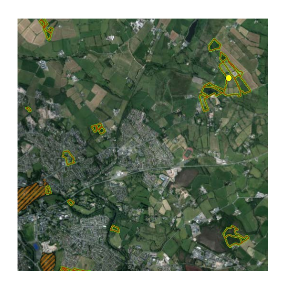
Industrial Heritage >150m+