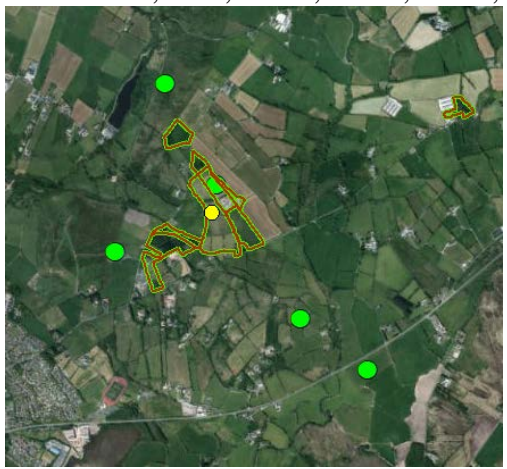
Register of Parks, Gardens & Demesnes >2.7km