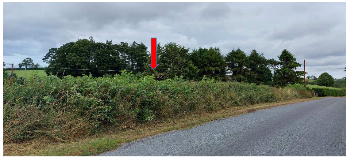
Fig 4 – Long distance critical view from the southwest

As states previously there is a grouping of established trees abutting the western boundary of the site and a hedging along the southern boundary and the remaining boundaries are undefined. I consider there is a minimal sense of enclosure as the site is a cut-out of a larger field and has a steep open topography up to it. However there the backdrop of the established trees will assist in integrating the proposal into the landscape.