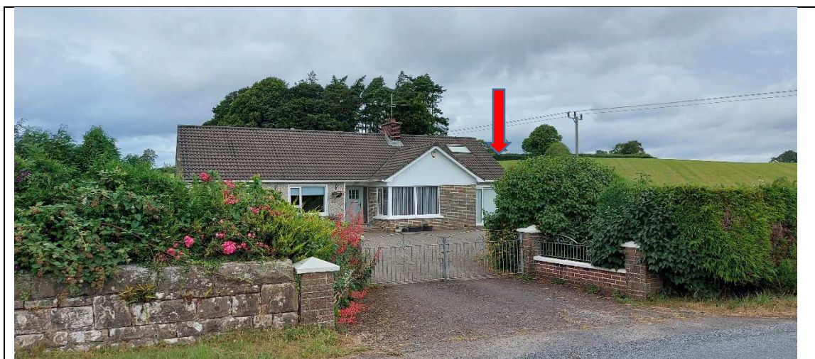
Fig 3 – Critical view from the road from the southwest at No. 65