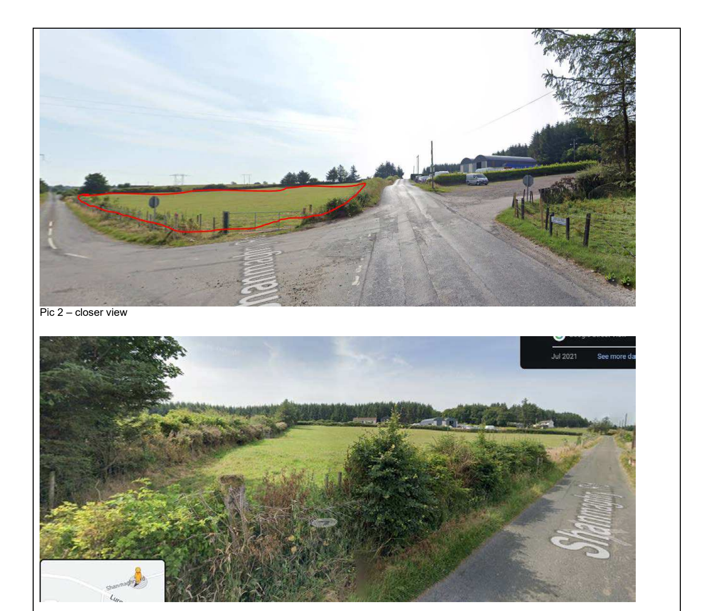
Pic 3 – proposed site in the foreground of the picture with car sales to the rear at grey barrel roofed buildings, crossroads to the right and Church not visible behind car sales

The application has been submitted for consideration as a dwelling within a cluster, Policy CTY2a. Members will be aware there are 6 criteria that must be met before planning permission can be granted under that policy. There have been occasions where the members have allowed development where it does not meet all the criteria, however those have been clearly set out as exceptions where they are well contained and surrounded by development and rounds off a cluster. Taking into account the images above, members will note there is development on the opposite side of Lurgylea Road from the site. That development is well contained and framed, a dwelling on the proposed site whoever will be open and exposed in views and will not, in my view read with it. A dwelling on this site will appear in isolation and does not meet the concept of clustering of development.