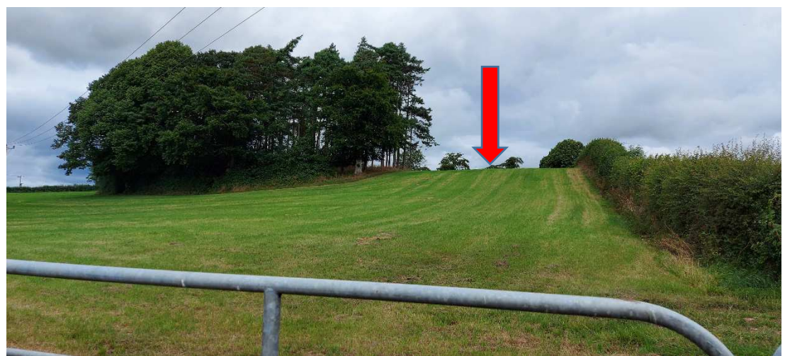
Fig 1 – The proposed dwelling will be located to the rear of the trees

The land rises up steeply at the site from the Roughan Road to the back of the site where it levels off. As shown in figures 1 to 4 below there are critical views of the dwelling in both directions. To the south west there will be no long distance critical views and the dwelling will only be visible when directly at the road in front of the site. To the north east there will be more open views but the dwelling would site against the backdrop of trees which are within the applicant's ownership.