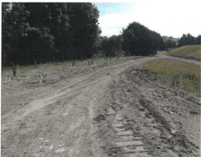
Pictures showing tree planting on the eastern flank of Cell 2 and the area at the Northern end of the site post planting.