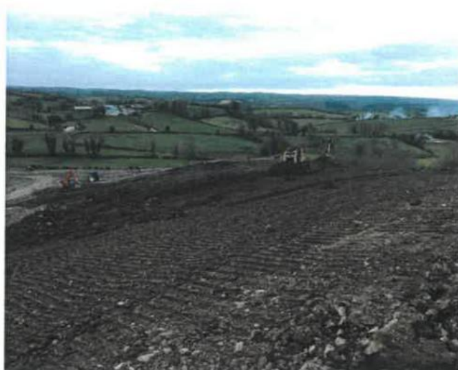
Pictures showing the Southern section of the site during grading of the soil stockpile area prior to covering with soil and tree planting.