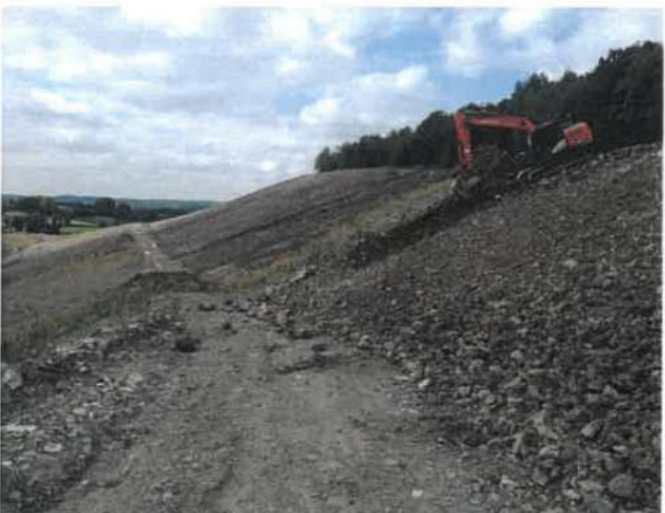
Pictures showing the final grading of the Cell 4 slopes which are now ready for either lining as a landfill cell or for landscaping. Slopes are to be seeded with wildflowers / grasses as an interim measure to reduce erosion.