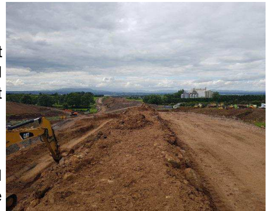
Earthworks on the Randalstown to Toome section of the scheme

Part of the scheme has been subject to a Judicial Review, and the High Court found in favour of the Department. When the decision was appealed, the Court of Appeal upheld the original judgement.