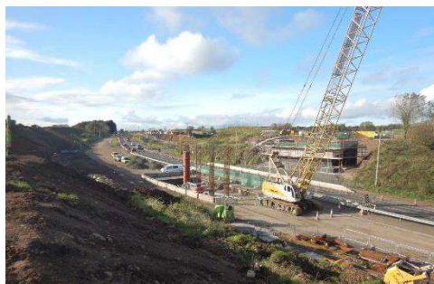
Randalstown West Overbridge under construction

To facilitate construction works, and to ensure the safety of both the workforce and travelling public, substantial temporary traffic management measures are in place.