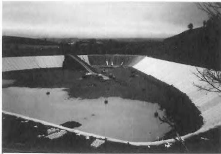
TULLYVAR LANDFILL SITE – OVERVIEW