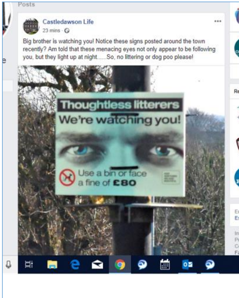
Fig 3. Post appearing in Castledawson Life

The 'watching eyes posters' also received some attention. Several people mentioned them when discussing dog fouling. 'Castledawson Life' also mentioned them in the course of one of its posts (see below). To this end it would seem they were effective in highlighting the issue of dog fouling.