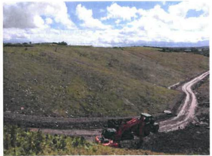
Pictures showing a before (left) and after (right) comparison of the Western Flank of Cell 4 following capping and seeding with wild grasses.