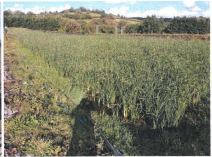
Pictures showing a before (left) and after (right) comparison of the new wetlands following the planting of 10,000 reeds.