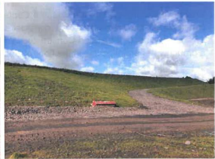
Pictures showing a before (left) and after (right) comparison of the finished cap following seeding with wild grasses on the Eastern flank of Cell 1 adjacent to the Site Office and Household Waste Recycling Centre.