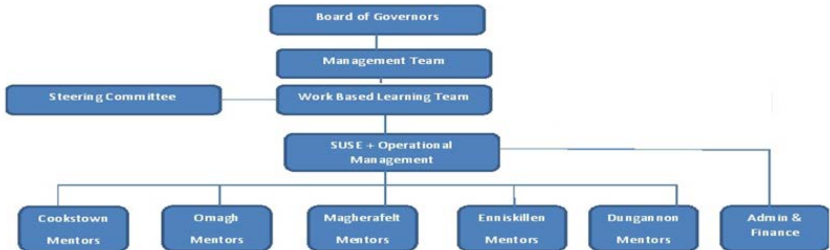
Organisational Chart SUSE +