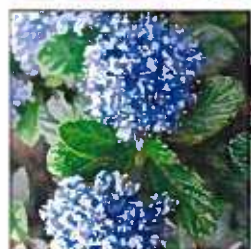
Ceanothus thyrsiflorus Repens