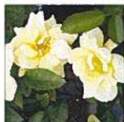
Rosa 'Flower carpet' Yellow