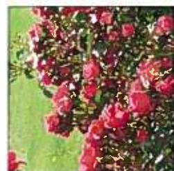
Rosa 'Flower carpet' Pink